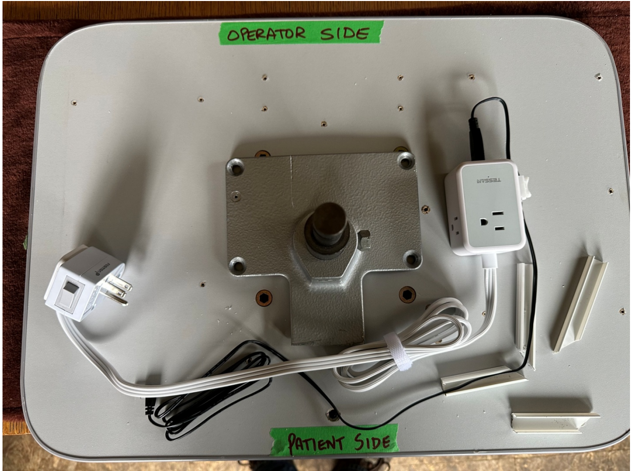
Left Handed Setup After LED Retrofit