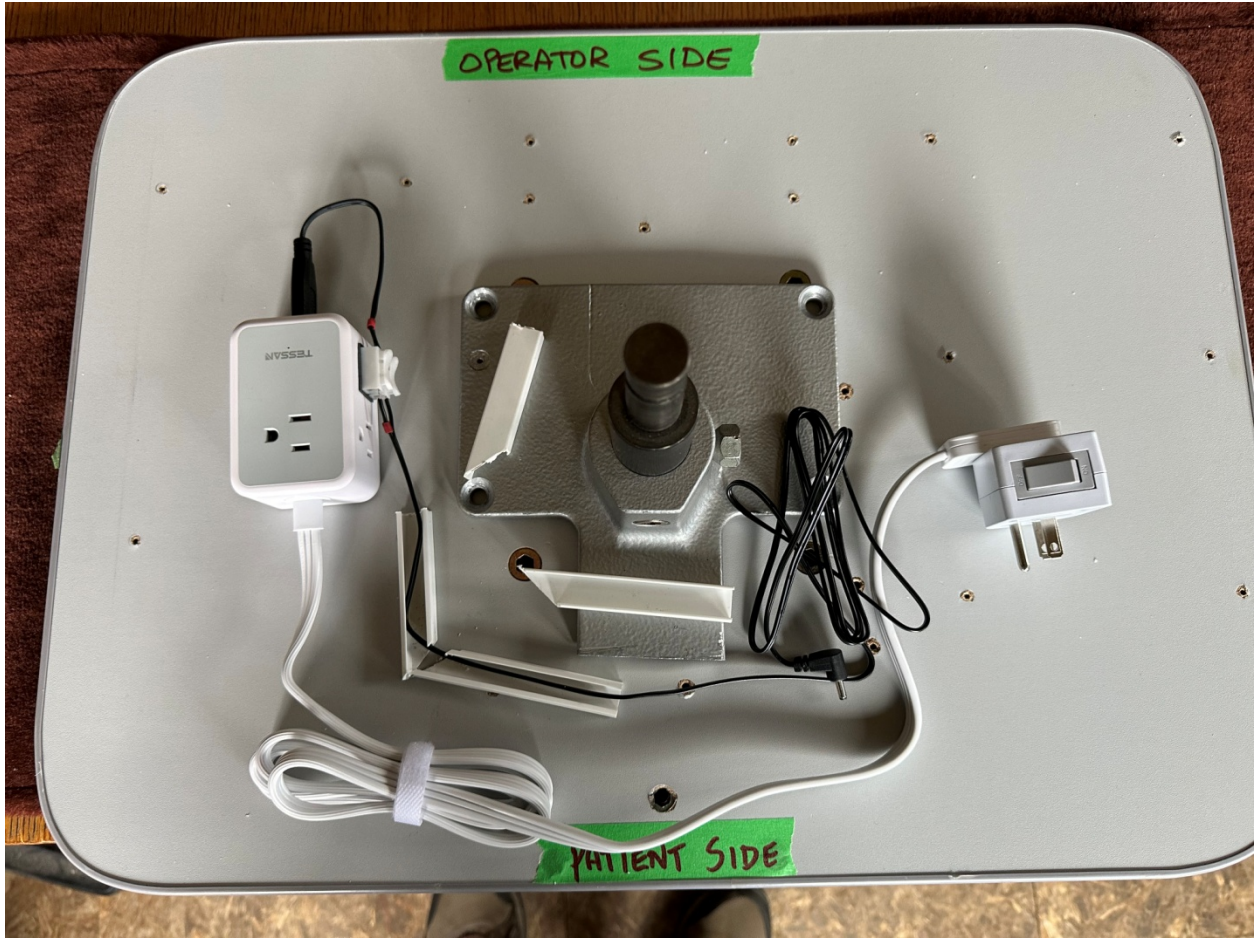
Right Handed Setup After Led Retrofit